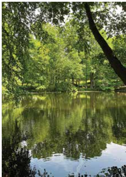
Todd Family land

In December 2014, Mianus River Gorge raised funds to acquire a 73-acre parcel of land known as the Levene Property. At the end of 2021, the family gave us an opportunity to complete this protection project through an offer to sell the final 4.56 acres. MRG's acquisition of this final piece protects a critical wildlife corridor and allows us to undertake a restoration project that will safeguard the ecological health of the entire 250-acre Castlebrook-Levene complex of diverse lands. MRG hopes to complete this restoration in 2022.