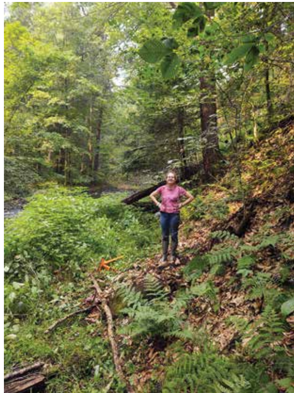
... and after