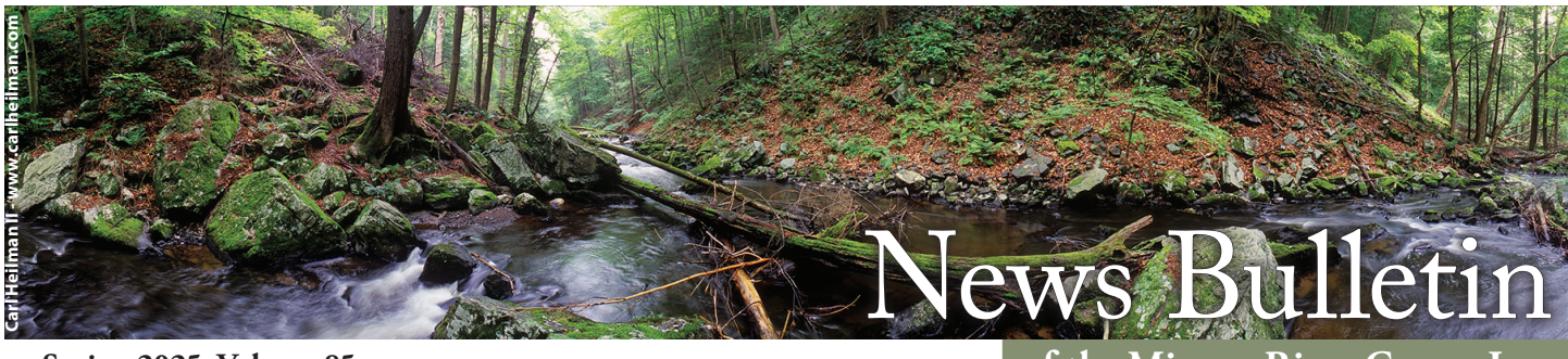
Spring 2025 Volume 85